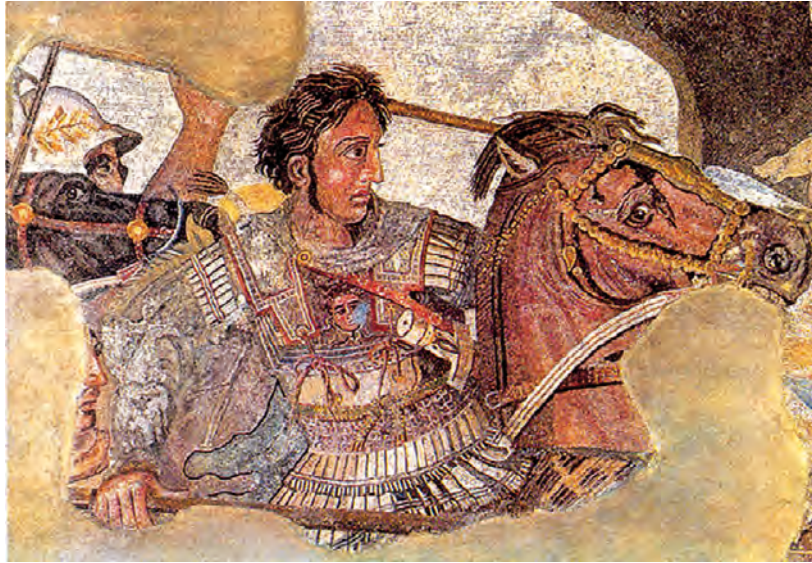
Fig. 1. Alexander the Great, a mosaic at the Naples National Archaeological Museum.

idealized Greek culture—could become a shared homeland for knowledge, in which philosophy and science could light up the known universe like a beacon, although this universe was constrained mostly to the Greek one. Alexandria can boast of having sheltered and bequeathed to us a wealth of knowledge through well-known characters who belong to the universal thought, philosophy—if we could separate them—, and history and science.