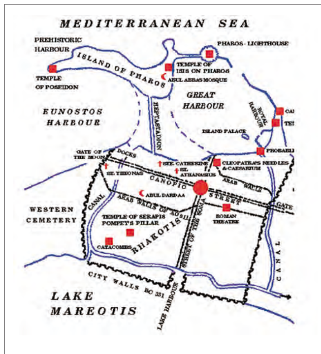
Fig. 2. Supposed plan of the ancient city of Alexandria.

The construction of the city of Alexandria was in charge of Alexander's architect, Dinocrates of Rhodes (4th century BC). The nearby isle of Proteus, who was called Pharos, was joined to the city by a dike seven stadia long (1285 m) and was,