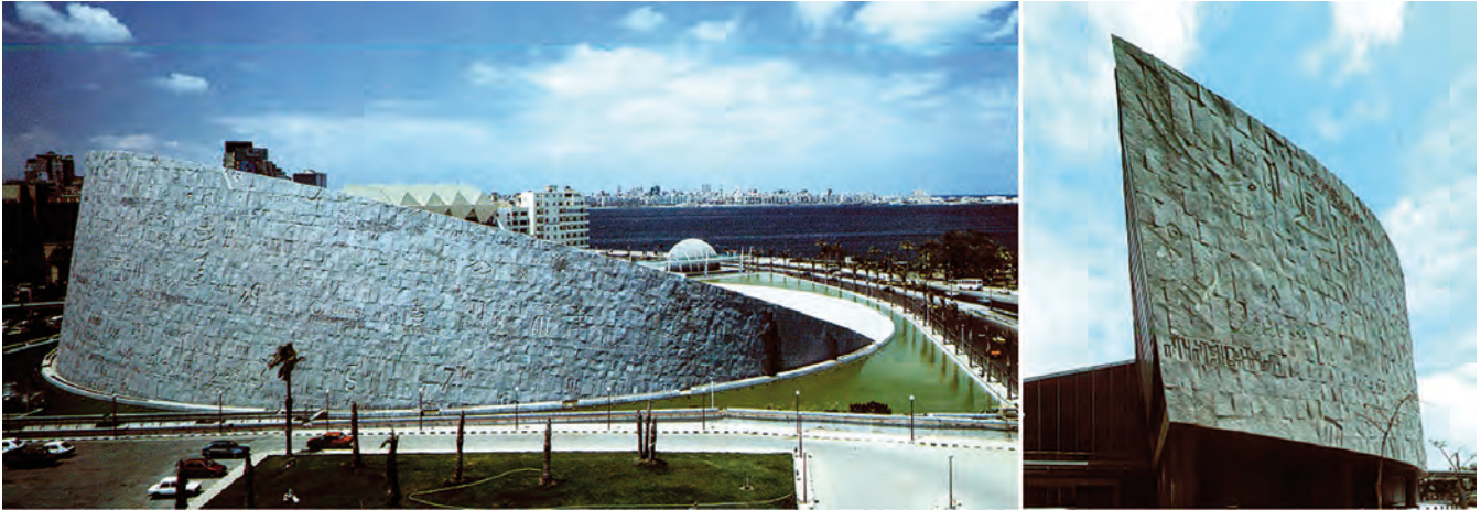
Fig. 8. Two views of the modern Library of Alexandria. (From the booklet Bibliotheca Alexandrina , published by the institution itself.)

survived its destruction and disappearance as it was a standard for knowledge. The Ptolemaic dynasty made great efforts to turn the city into a focal point where science, art, literature and philosophy could flourish; for this, they attracted anyone interested in studies from every place in the known world, offering them accommodation at what were to be two unique and unprecedented environments to study, the Musaeum and the Library.