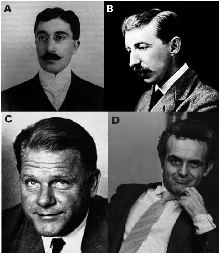
Fig. 7. (A) Constantine Cavafy (1863–1933). (B) Edward M. Forster (1879–1970). (C) Lawrence Durrell (1912–1990). (D) Terenci Moix (1942–2003).

for this I was happy in that place, of which I consider Cavafy representative. It has been a miscellany, a bastardy, during almost two thousand years—since it was founded by a Macedonian who believed in miscegenation and believed his father was an Egyptian god” [6] (Fig. 7).